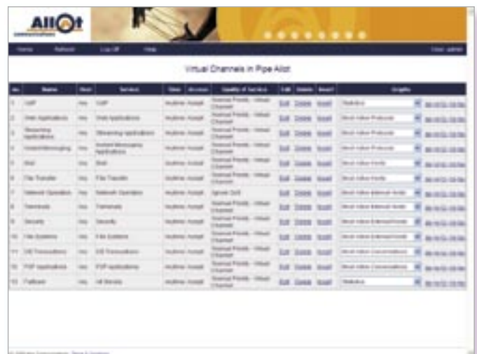
NPP self-provisioning "My Pipe" view